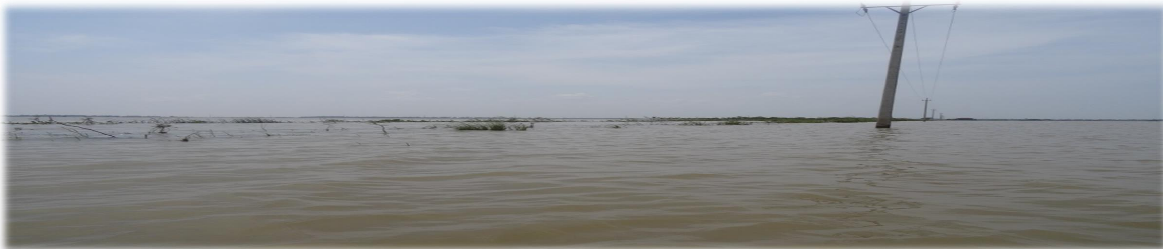
Restoration Rural Road Project LGCC 23 July 2013 Borey Cholsa Commune, Borecholsa District TAK