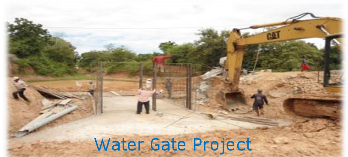
Water Gate Project