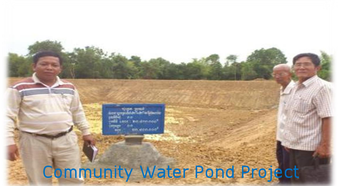
Community Water Pond Project