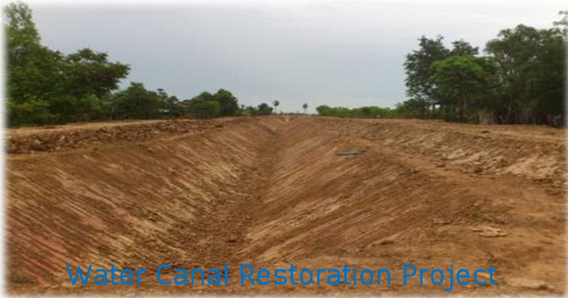
Water Canal Restoration Project