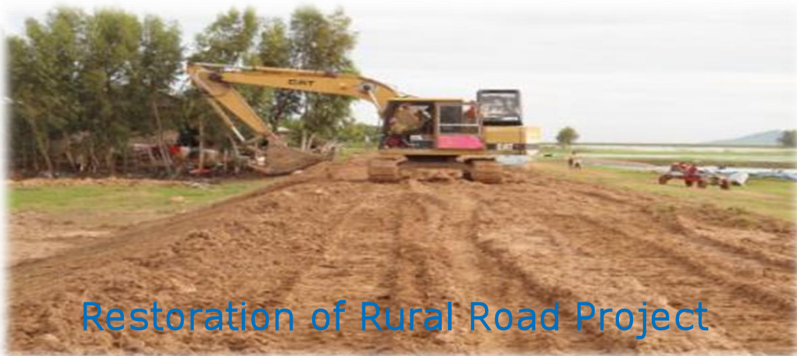
Restoration of Rural Road Project