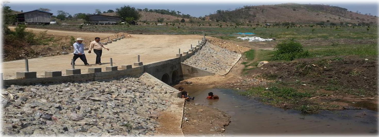
Water Gate Project and Spilt Water Dam