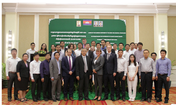
Group photo of the participants, 27 th September 2017 in Phnom Penh

of climate change. This analysis provided evidence to support climate-proofing of key projects during budget negotiations;