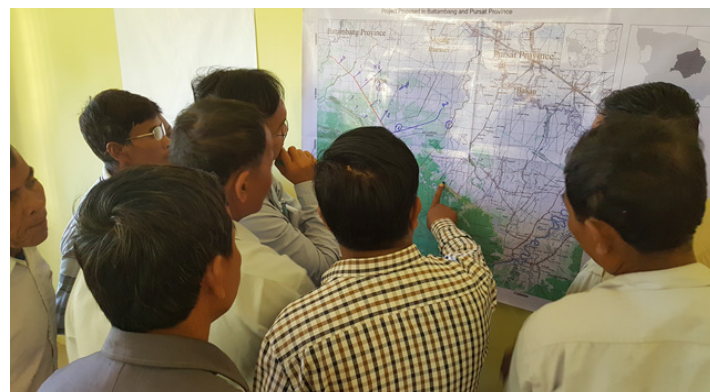
Technical experts together with sector officials examine feasibility of canal system expansion, 2017, in Pursat Province

In parallel, the project is training 46 villages around the Damnak Chheukrom Canal to develop and implement Safer Village Plans. The Safer Village Plans describe the steps the community must take to reduce their disaster risks, including maintaining Early Warning Systems that will monitor water levels in the canal and alert villagers when they need to evacuate.