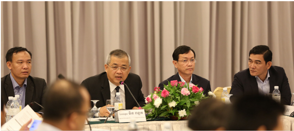
NCS's Secretary General opens first meeting of CCTWG with DPs, 27 th Jun 2017 in Phnom Penh