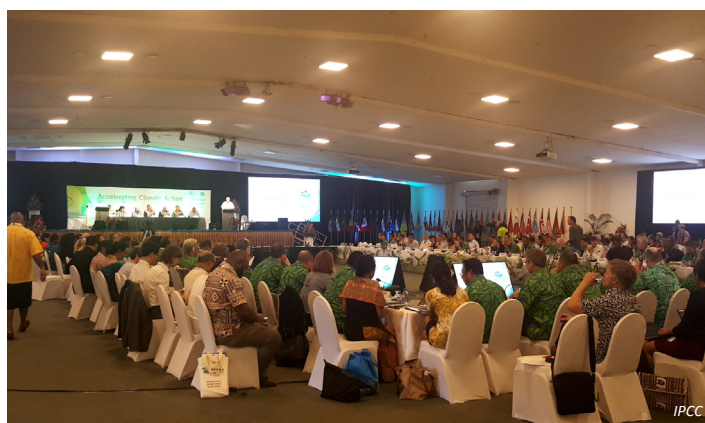
Delegates attend the pre-COP23 meeting, October 2017 at Fiji

The meeting counted with more than 300 participants, bringing together Ministers, Heads of Climate Change Delegations and Chief Negotiators from 68 countries. This was the largest pre-COP meeting so far in the history of UNFCCC, revealing that Parties remain actively committed to expediting the operationalization of the Paris Agreement and work out the details regarding financial, capacity and technology transfer issues.