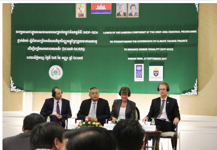
Representatives of UNDP RBAP, GSSD, Sweden Embassy, and UNDP-Cambodia, at the project launch, 27 th September 2017 in Phnom Penh